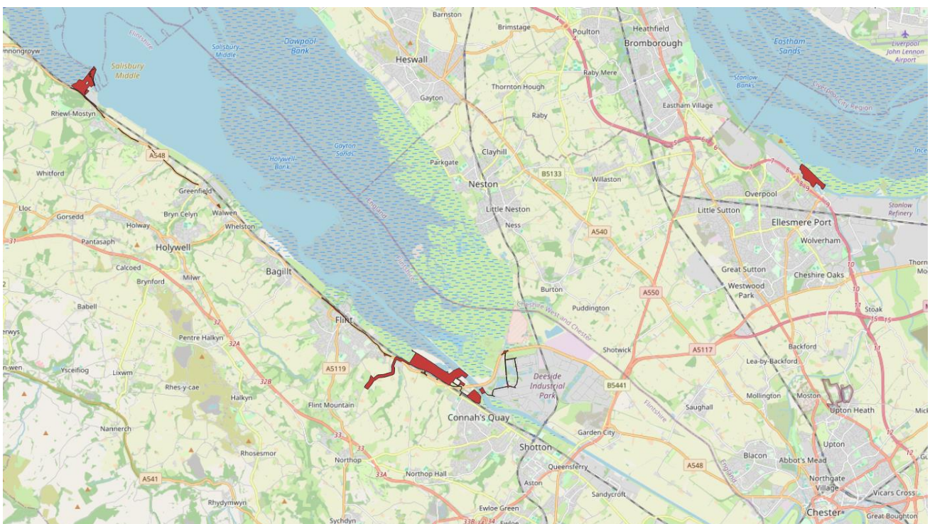
Figure 1 – indicative Order Limits

The indicative Order Limits for the Proposed Development are within the administrative boundaries of Flintshire County Council and Cheshire West and Chester Council. Figure 1 below shows the indicative Order Limits for the project.